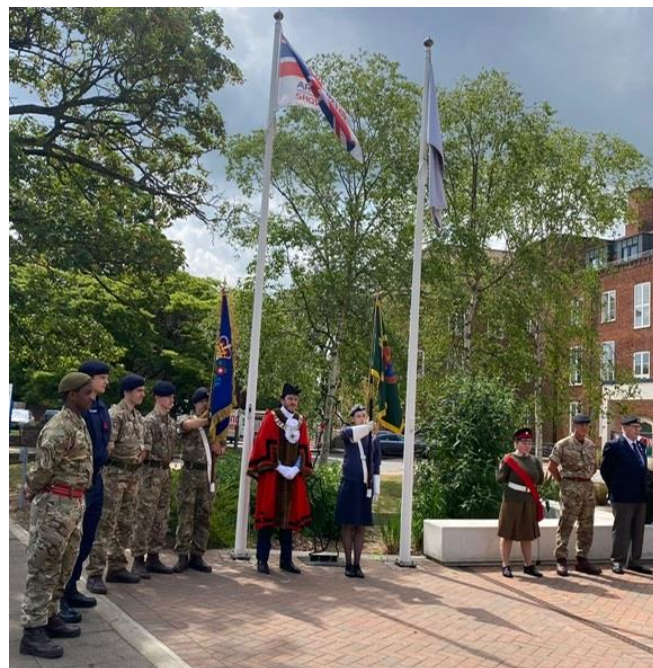
All cadets looked amazing whilst supporting the ceremony, excellent role models for our CCF.

We are very grateful to everyone that supported the school in running this popular event.